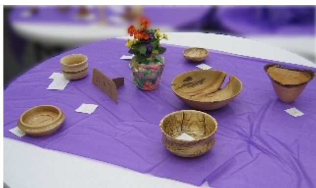
Novice Category entrants.