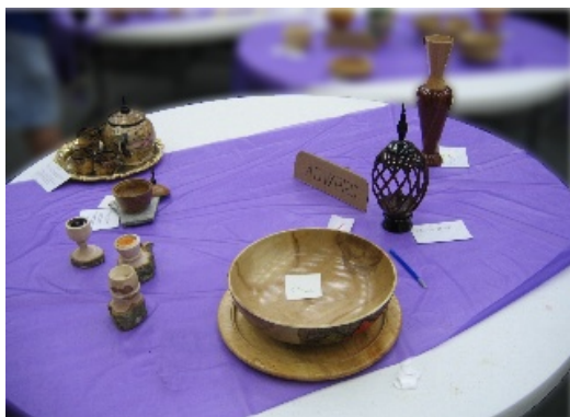
Advanced Category entrants.