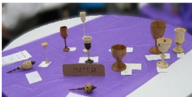
Intermediate Category entrants.