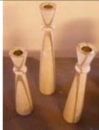
Candlesticks, Troy Porter