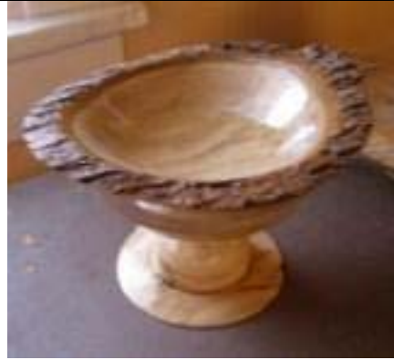
Natural Edge Bowl, Ray Zakrajsek