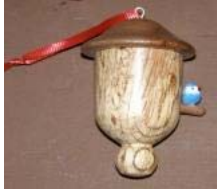
Ornament, Troy Porter