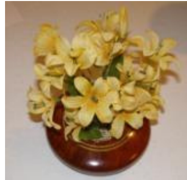
Larry Jr's Flower Pot