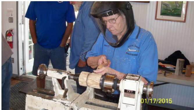
Some pictures from the January Hands-on session